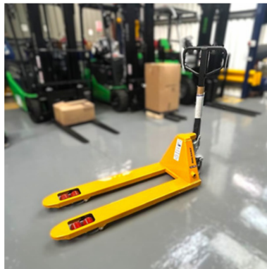
Hand Pallet Truck

If you require a pallet truck but not sure which would suit you best, we've got a quick guide to help you.