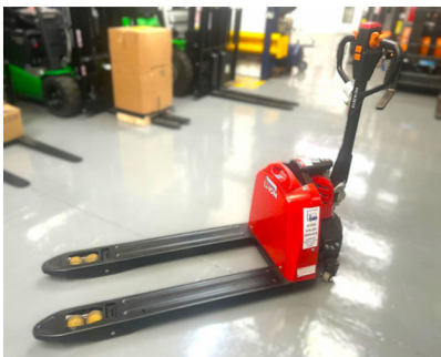
Powered Pallet Truck